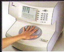
2 SCAN FINGERS Less than 1 second