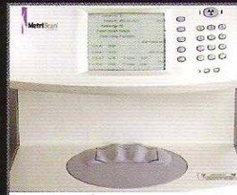
3 CALCULATE & DISPLAY T SCORE 45 seconds